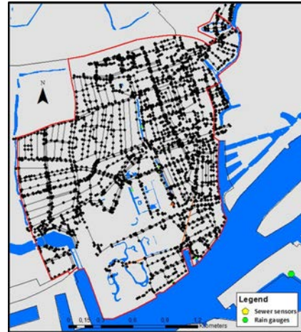
Figure 1: Monitoring and sewer system

The sensors will be pressure sensors: used at 0,35 bar or 0,7 bar range. All sensors will be equipped with wireless real-time