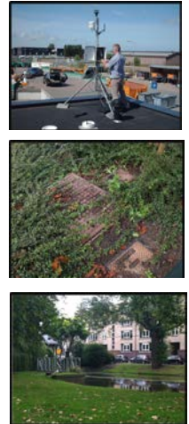
Figure 1: Monitoring and sewer system