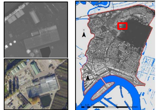
Figure 2: DTM