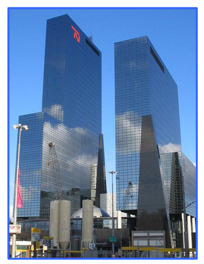
The Delftse Poort in Rotterdam (© Wikipedia/Michiel1972).

Precipitation in the city – The rain radar, which is currently being built in Rotterdam, specialises in measuring local precipitation. The radar will make it possible to measure precipitation patterns in the city much more accurately and, as such, facilitate improvements in the quality and efficiency of the city's water management. Possible applications for the data include the intelligent control of pumping stations, the use of water storage (such as the water squares) and local weather reports. Noordwijk-based SSBV Aerospace & Technology Group